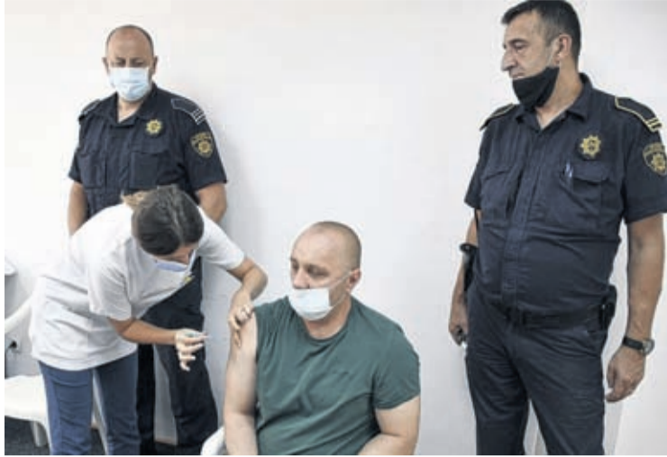
(AP) — Bosnia’s rate of vaccination against the coronavirus is one of the lowest in Europe, but one population in the Balkan country has bucked the national trend: its prison inmates. Over 80% of the 2,000 men

and women serving sentences in Bosnia’s 13 prisons have received at least one dose of a COVID-19 vaccine. That compares to slightly over 27% for the nation as a whole, a rate that results from a lack of takers, not an absence of shots.